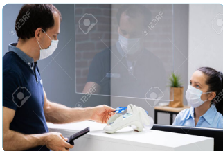
Plastic, Plexiglas, Acrylic, Lexan, Polycarbonates