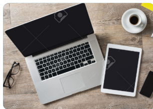
Laptops, Tablets, Camcorders, Copiers, Scanners